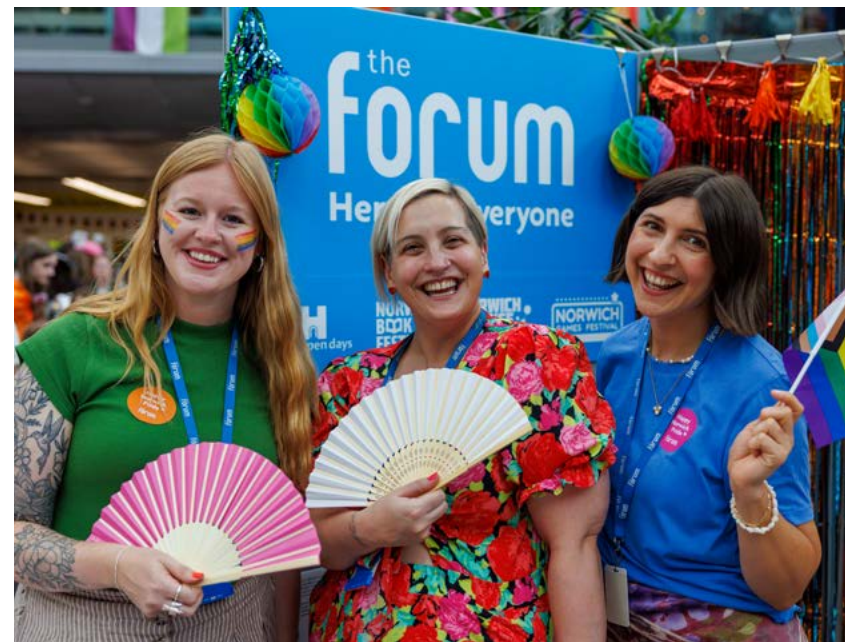
Images left to right: Norwich Games Festival Quiz; The Forum team at Norwich Pride; Norwich Games Festival.