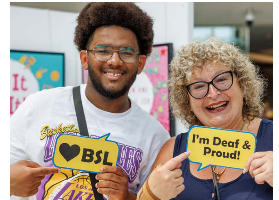
Images left to right: Norwich Science Festival; Nara to Norwich exhibition by the Sainsbury Institute for Japanese Arts and Culture; Norfolk Deaf Festival.