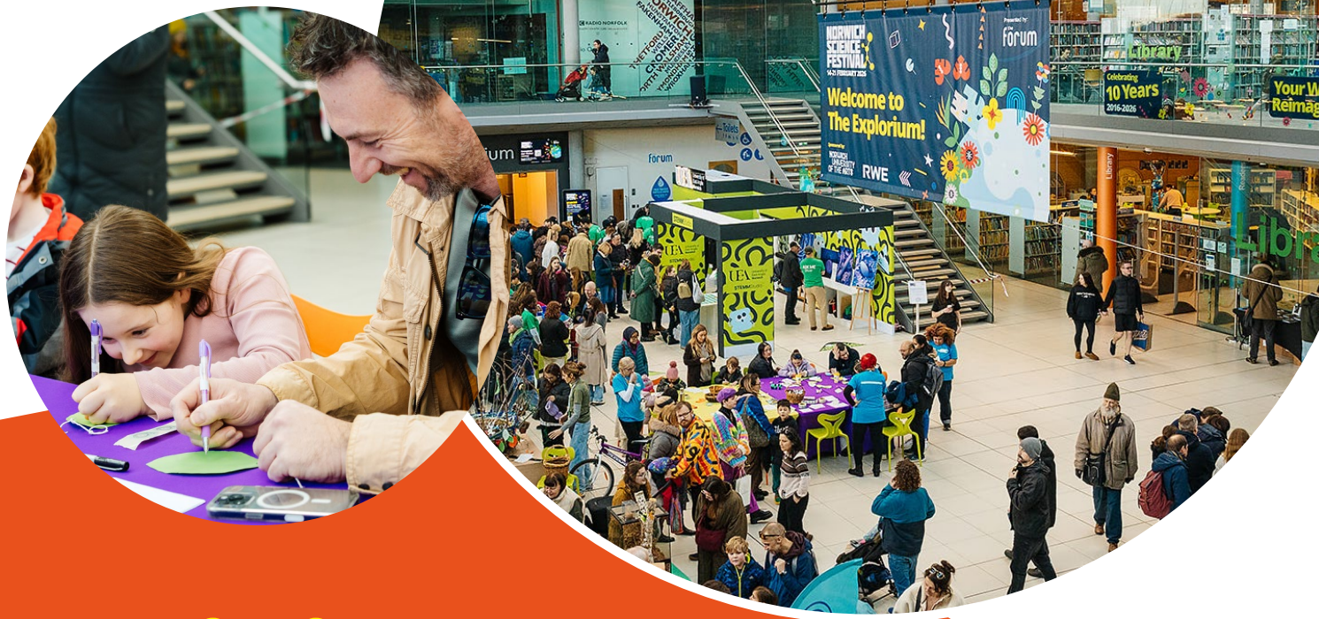
Exhibit at The Explorium

Exhibiting at Norwich Science Festival is a fantastic way to reach our remarkable and diverse audiences, showcase the work you are doing in your industry, raise brand awareness and share your expertise and passion.