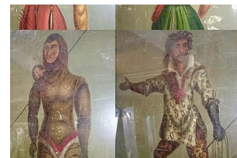
Thorns DIY Store